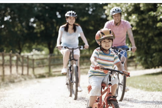
Embark on a new cycle of life.