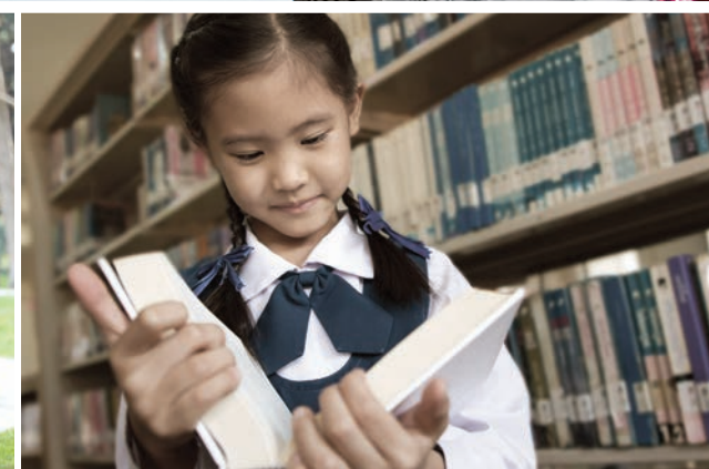
Good schools abound and within reach.