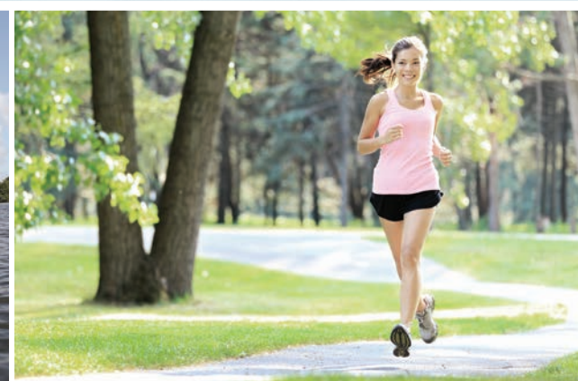
Keeping fit has never looked this good.