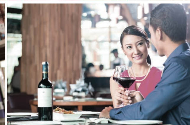
Close to eateries and restaurants.