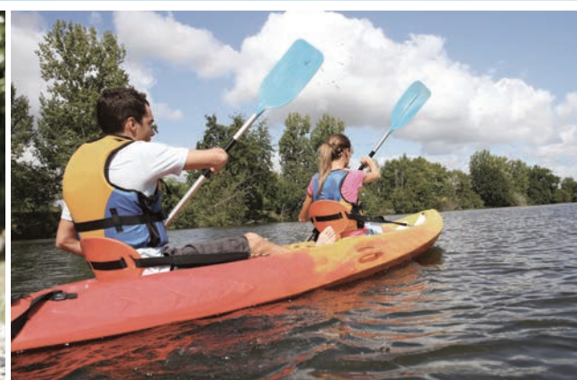
Enjoy more water-based activities.